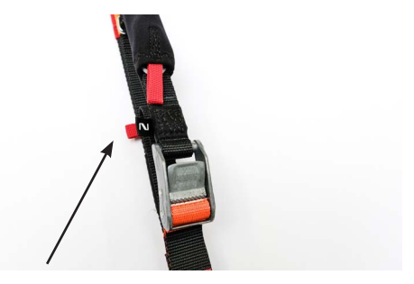
"Trim neutral" indicator