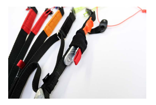
Clamp cleat system